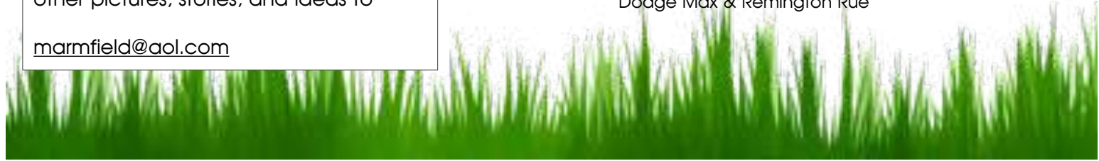
Dodge Max & Remington Rue