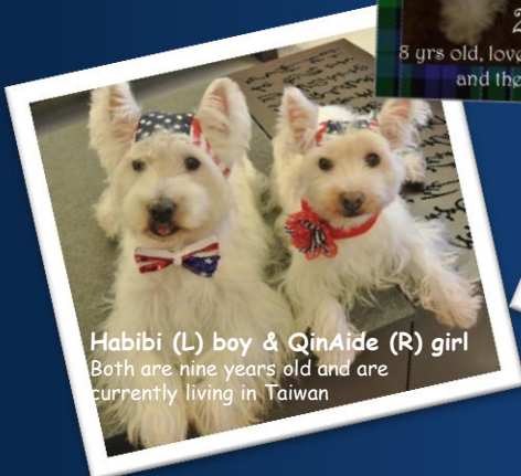
Habibi (L) boy & QinAide (R) girl Both are nine years old and are currently living in Taiwan