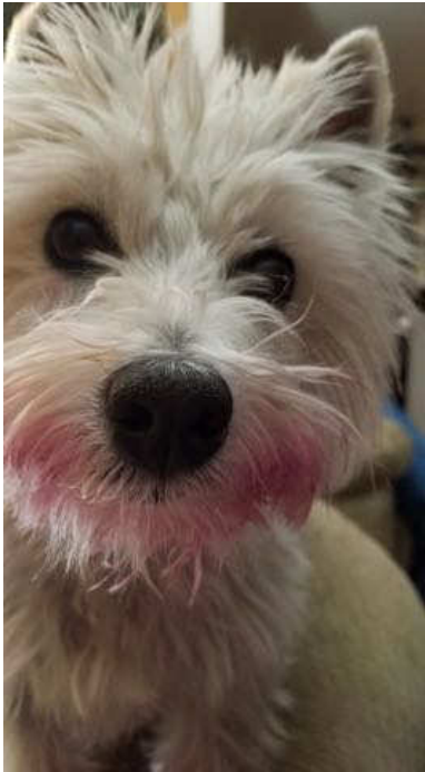
Kya got in the lipstick